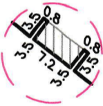
HOUSE DETAIL NOT TO SCALE