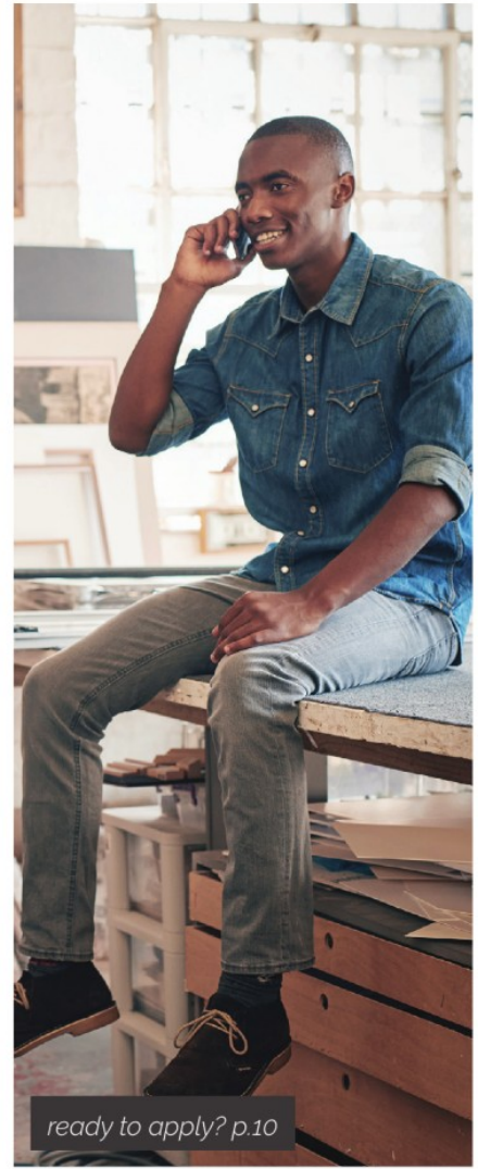
ready to apply? p.10