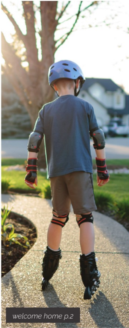
welcome home p.2