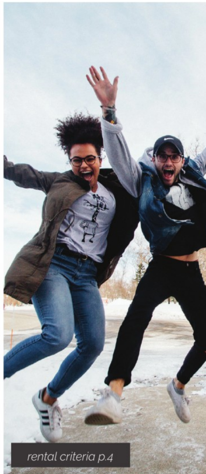
rental criteria p.4