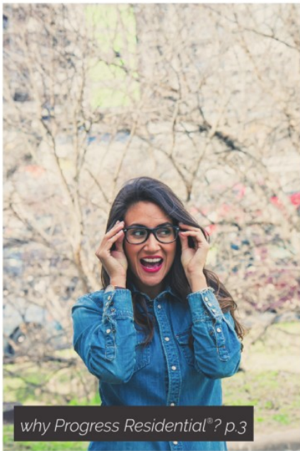
why Progress Residential®? p.3