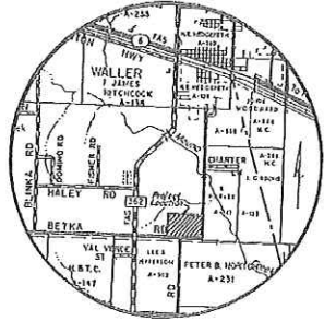
KEY MAP - 1" = 1 MILE