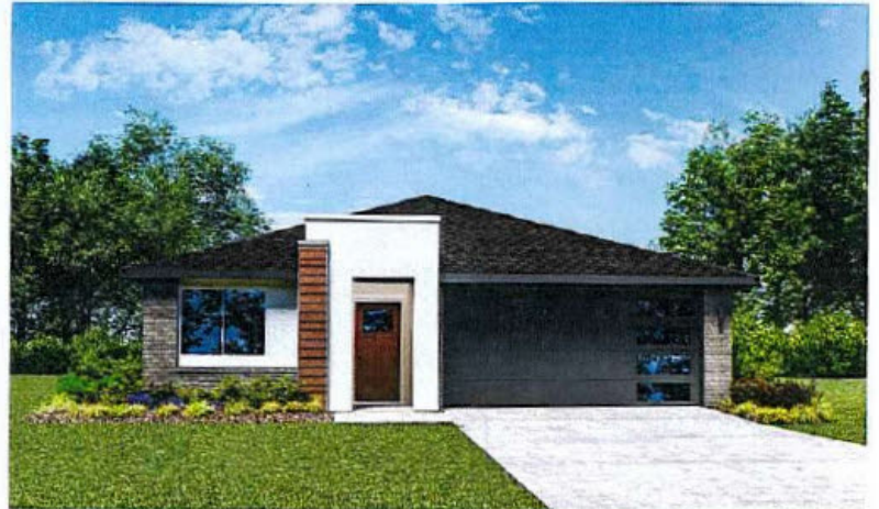
Elevation L w/ Optional Woodtone