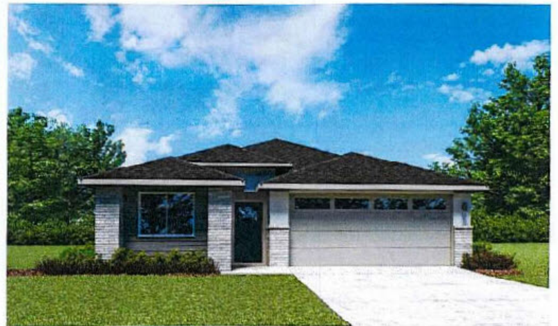
Elevation N w/ Optional Woodtone