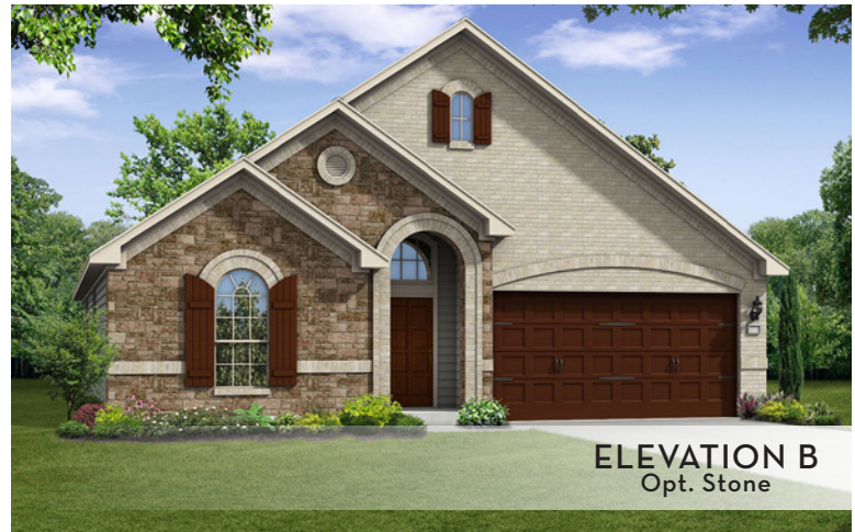
ELEVATION B Opt. Stone