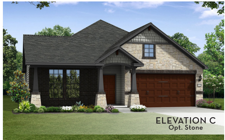
ELEVATION C Opt. Stone