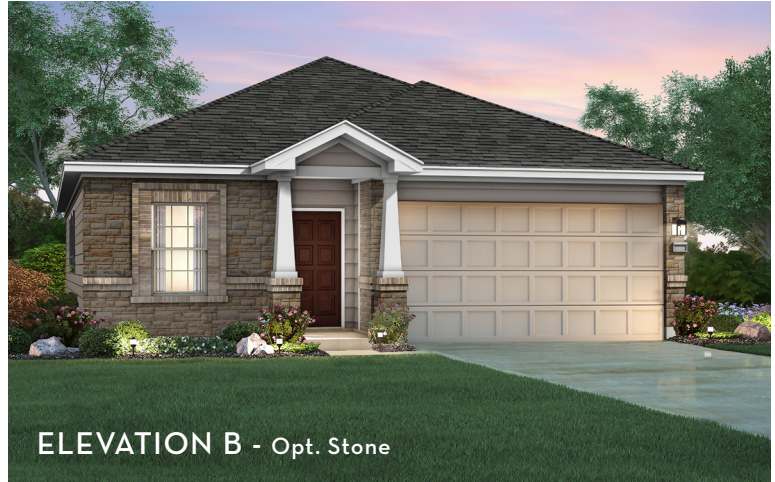
ELEVATION B - Opt. Stone