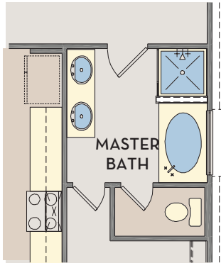
OPT. MASTER LUXURY BATH