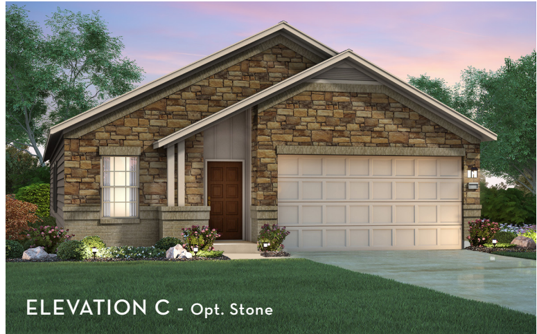
ELEVATION C - Opt. Stone