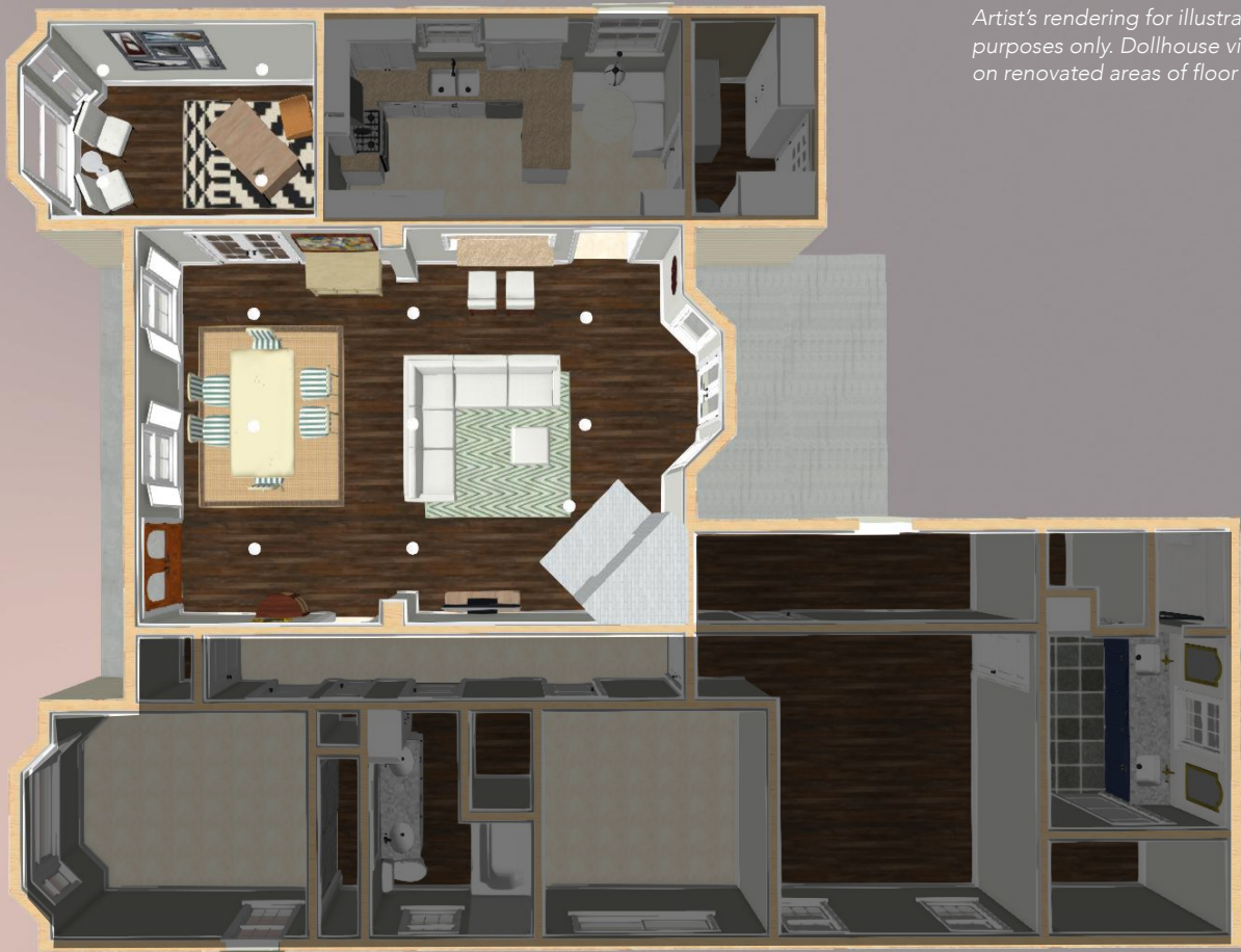
Artist's rendering for illustrative purposes only. Dollhouse view focusing on renovated areas of floor plan.