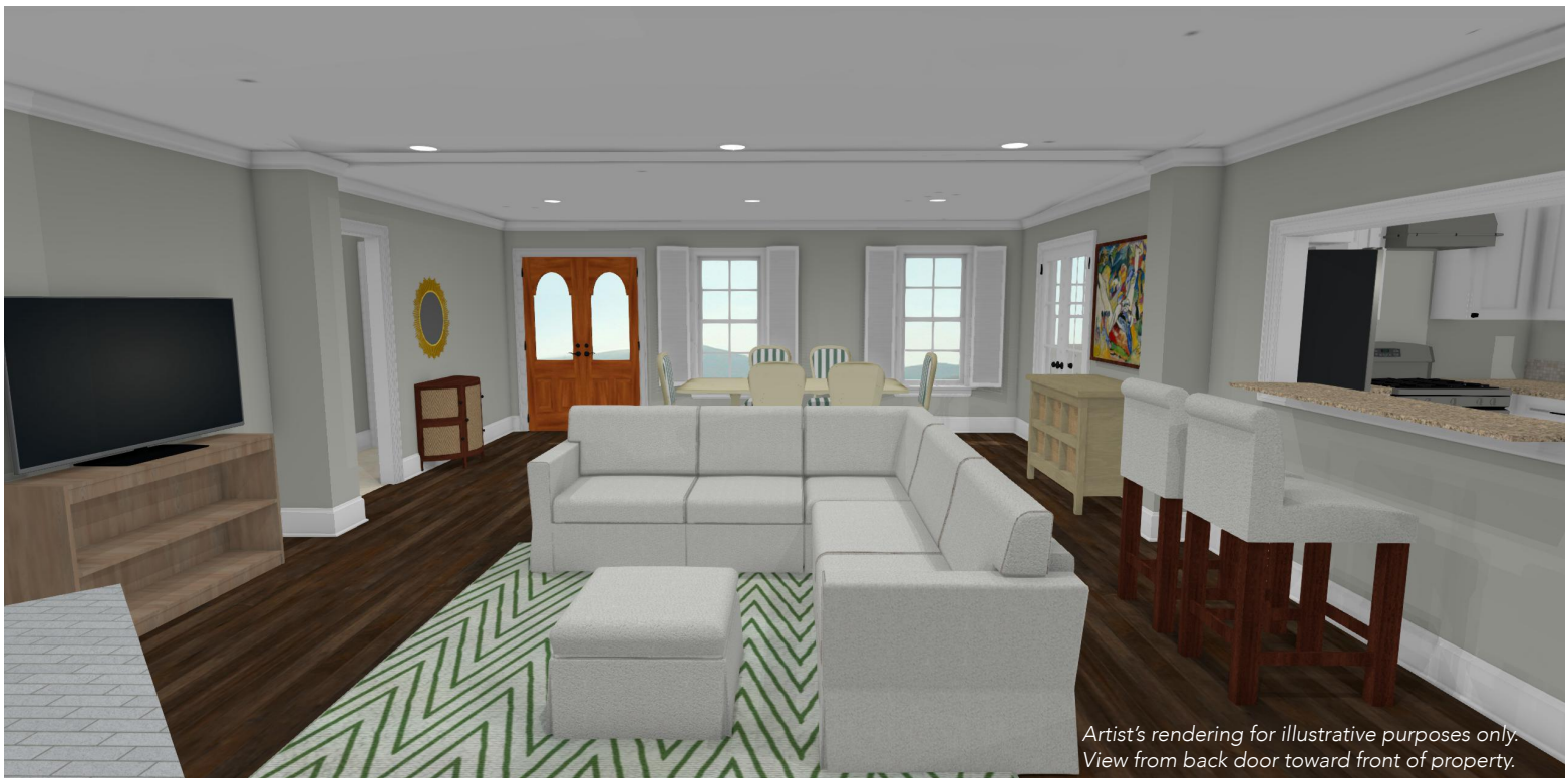
Artist's rendering for illustrative purposes only. View from back door toward front of property.