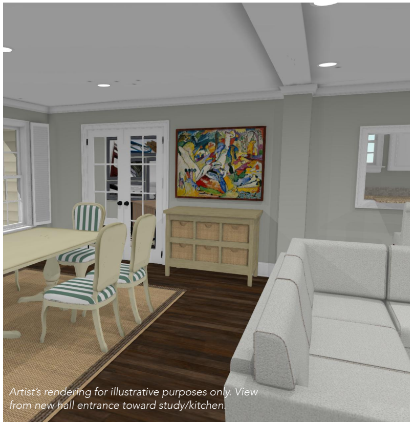
Artist's rendering for illustrative purposes only. View from new hall entrance toward study/kitchen.

Formed in 2011, Cavetto Homes is focused on providing quality service from concept to completion. The two principal owners have more than 20 years combined experience in the building industry. Focused on Houston and the surrounding areas, Cavetto has been blessed to help homeowners see their dreams realized. We believe in a transparent approach, providing our clients access to all information necessary to make sound decisions. Cavetto understands the value of your hard earned money and is committed to serving our customers equally, regardless of the size of the project.