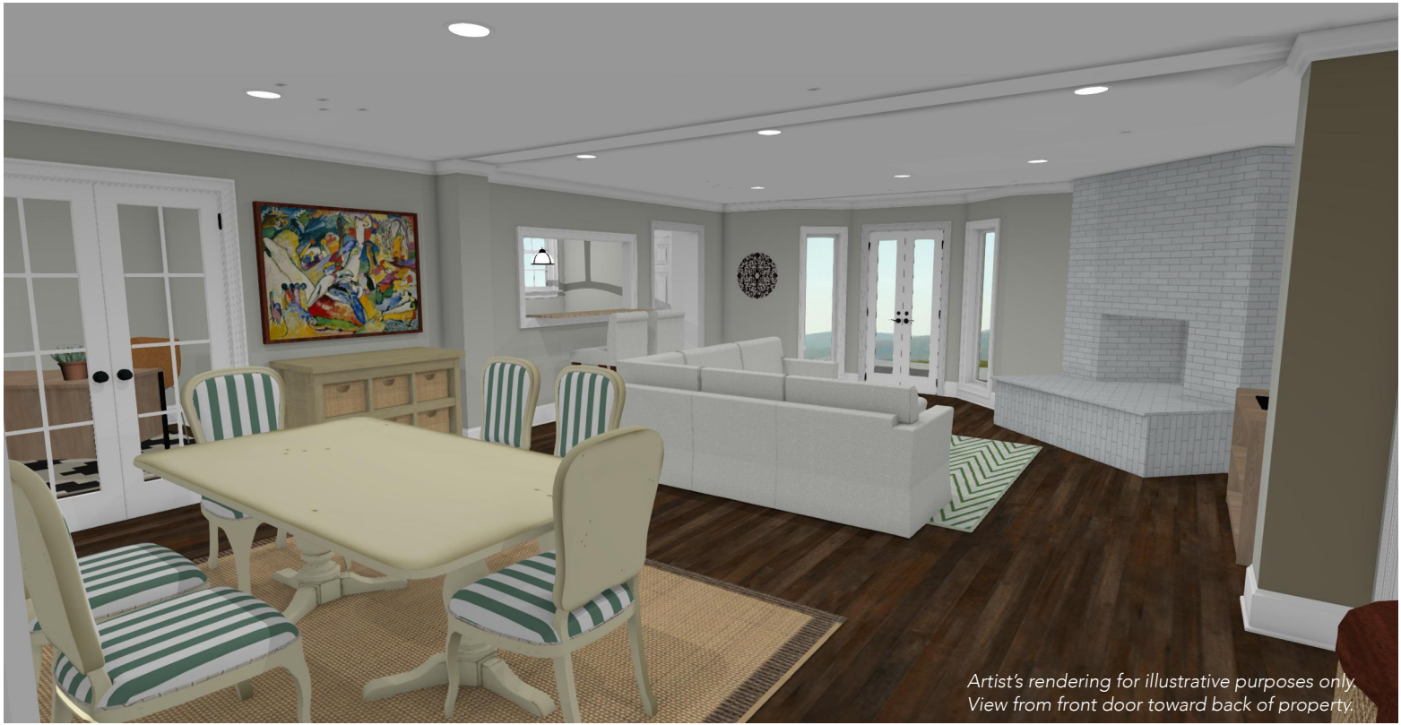
Artist's rendering for illustrative purposes only. View from front door toward back of property.