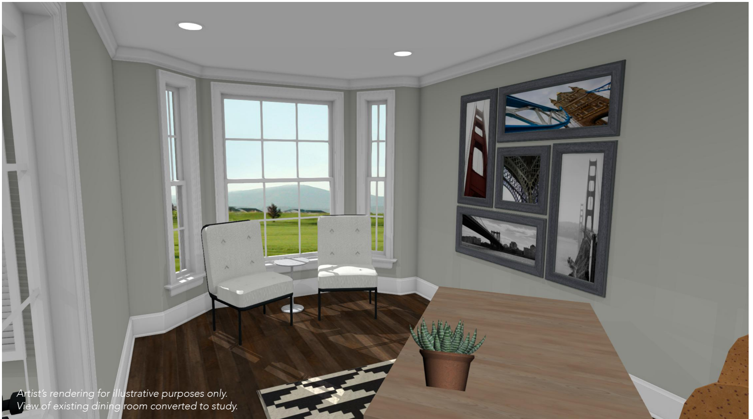
Artist's rendering for illustrative purposes only. View of existing dining room converted to study.