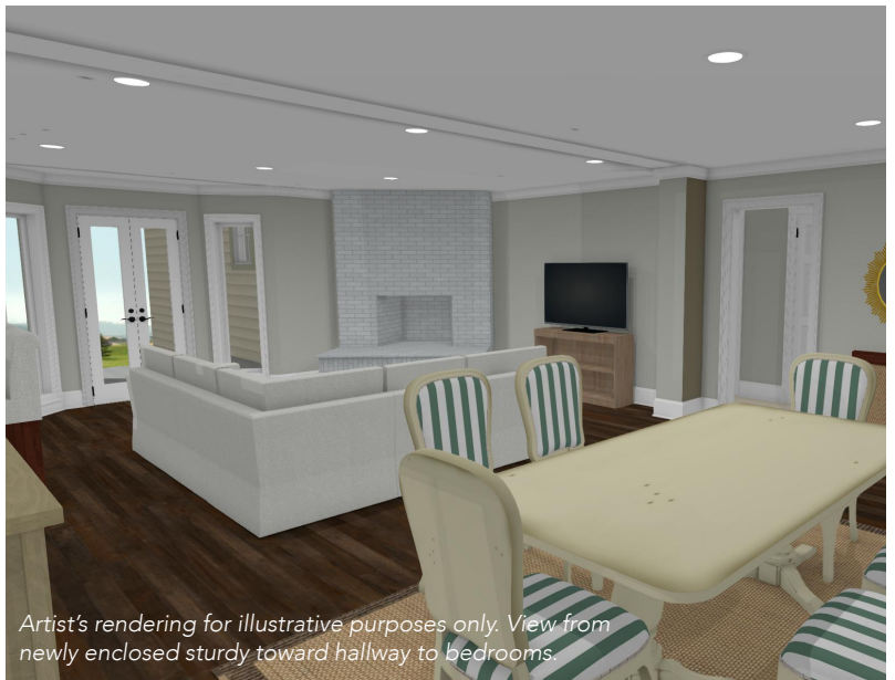
Artist's rendering for illustrative purposes only. View from newly enclosed sturdy toward hallway to bedrooms.