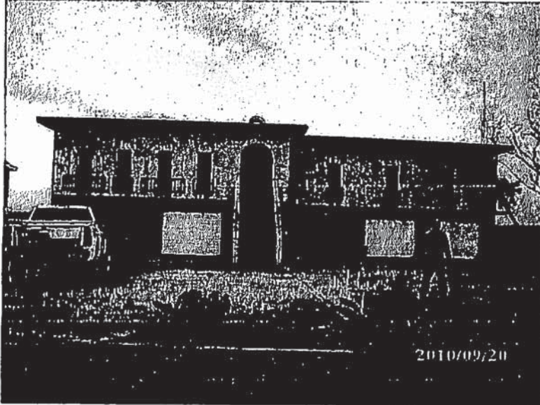
Picture Taken September 20, 2010