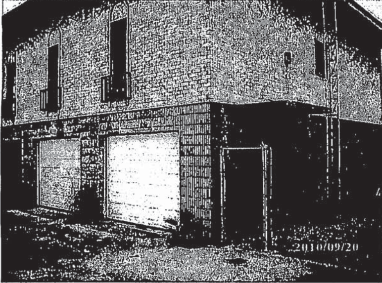
Picture Taken September 20, 2010