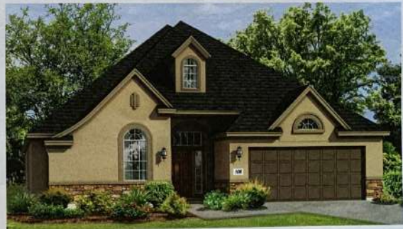
ELEVATION C - W/ OPT. STONE