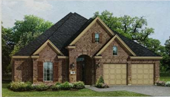
ELEVATION A - W/ OPT. STONE