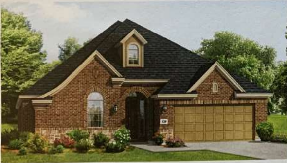
ELEVATION B - W/ OPT. STONE