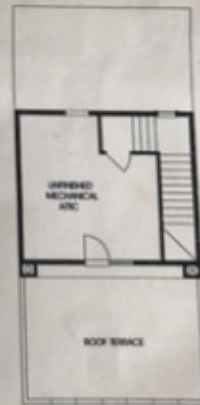
Fourth Floor 18 sq.ft.