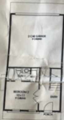
First Floor 323 sq.ft.