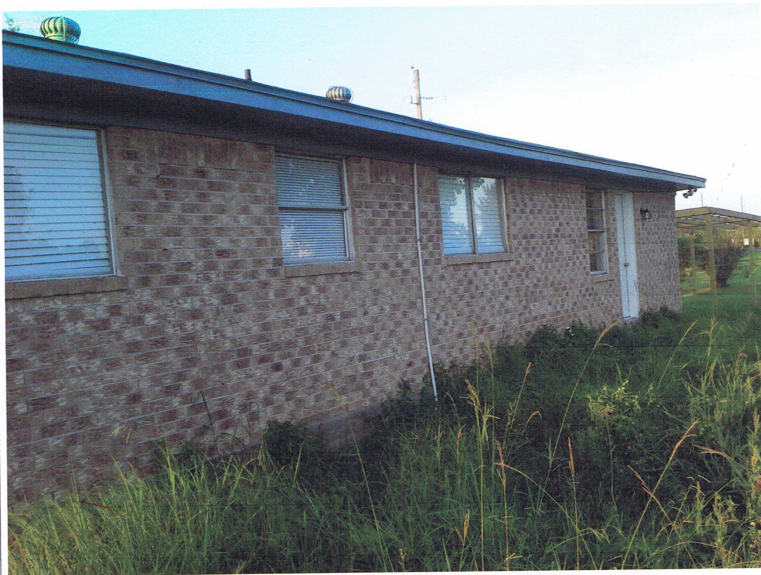
August 7, 2014 Rear View

If submitting more photographs than will fit on the preceding page, affix the additional photographs below. Identify all photographs with: date taken; "Front View" and "Rear View"; and, if required, "Right Side View" and "Left Side View." When applicable, photographs must show the foundation with representative examples of the flood openings or vents, as indicated in Section A8.