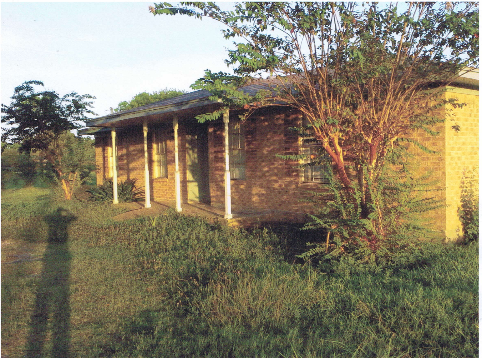
August 7, 2014 Front View

If using the Elevation Certificate to obtain NFIP flood insurance, affix at least 2 building photographs below according to the instructions for Item A6. Identify all photographs with date taken; "Front View" and "Rear View"; and, if required, "Right Side View" and "Left Side View." When applicable, photographs must show the foundation with representative examples of the flood openings or vents, as indicated in Section A8. If submitting more photographs than will fit on this page, use the Continuation Page.