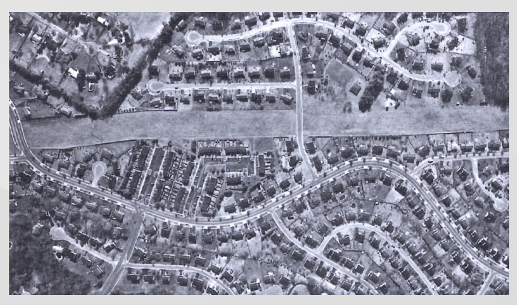
Aerial View of Ideal Easment in Developed Area