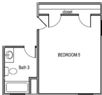
OPTIONAL 5 BED 3.5 BATH