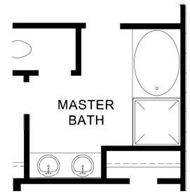
OPTIONAL MASTER BATH