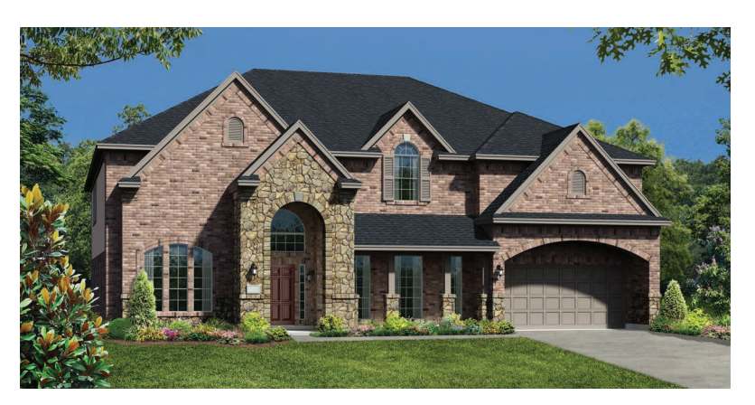
ELEVATION B - SHOWN W/ OPT. STONE