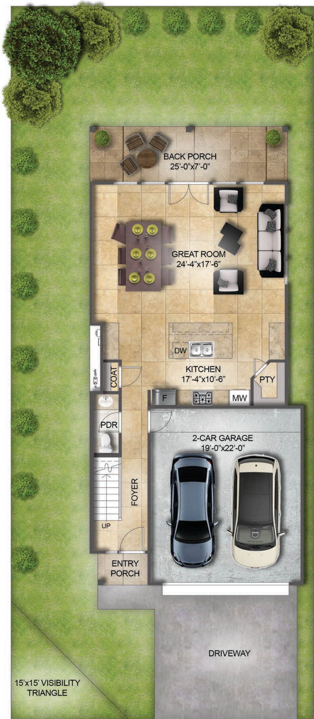
FIRST FLOOR ON SITE PLAN