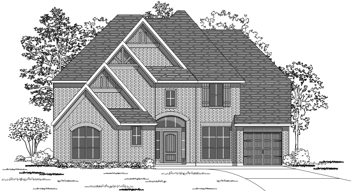
Design 3790W E-1