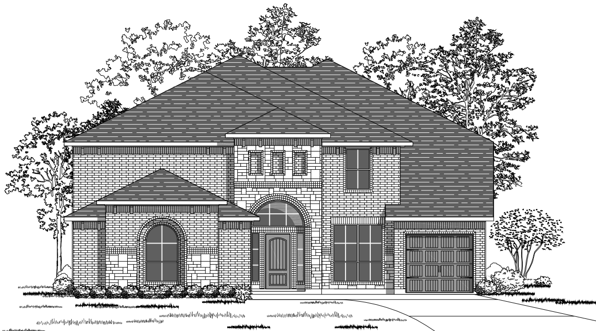
Design 3790W E-50

This design, as originally designed and prior to any changes you make, is estimated to yield approximately the number of square feet shown on page 1. All dimensions are approximate. Square footage may vary based on as-built dimensions, configurations, plan options and/or the method of calculation. Designs are not-to-scale, and are conceptual illustrations that may differ from construction plans or completed improvements. A design may depict features not available on all homesites or in all communities. Perry Homes reserves the right to make changes in plans and specifications, and to substitute material of similar quality. Prices, terms, promotions, plans, dimensions, features, options, amenities, elevations, designs, square footages, specifications, materials, and availability of homes or communities are subject to change without notice or obligation. All obligations will be governed by a written contract. This design does not constitute a commitment to build a particular floor plan or home in any given community. Some floor plans, options, and/or elevations may not be available on certain homesites or in a particular community and may require additional charges. Please check with Perry Homes to verify current offerings in the communities you are considering. This rendering is the property of Perry Homes, LLC. Any reproduction or exhibition is strictly prohibited. © Perry Homes, LLC 2015