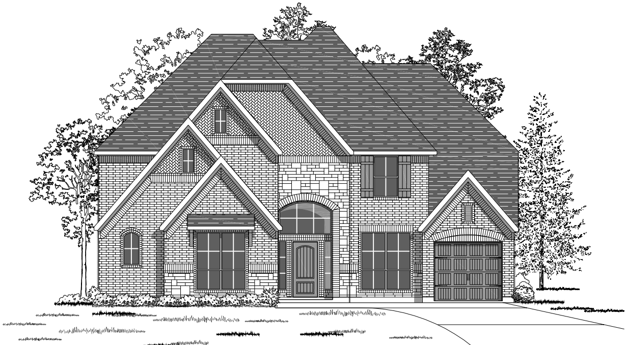
Design 3790W E-30