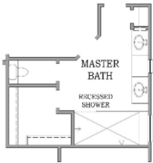
Optional Master Bath