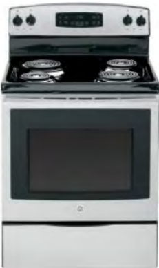
Stainless steel appliance pkg: stove, built-in microwave & dishwasher