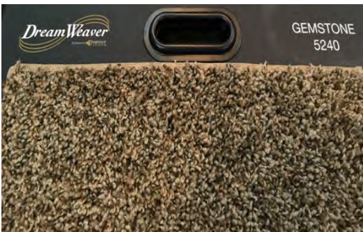
Upgraded carpet has color that goes all the way through each fiber. The color won't stain, fade or wear off. Lifetime Stain, Fade & Pet Urine Resistant Warranty. 10 Year soil, abrasive, texture retention & manufacturing Warranty.