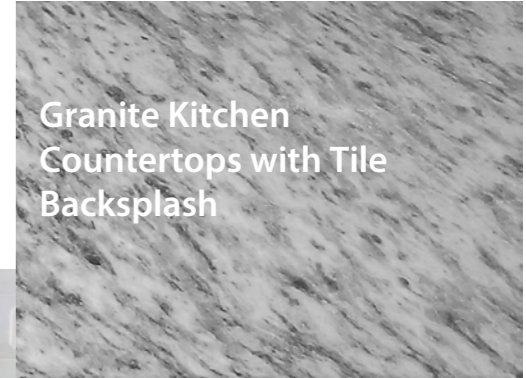
Granite Kitchen Countertops with Tile Backsplash