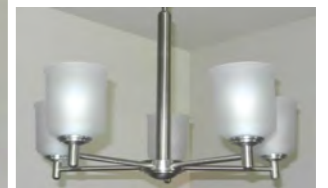
Modern Brushed Nickel Chrome and recessed lights ; Ceiling Fans with Cherry Blades