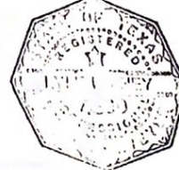
EXHIBIT A PAGE 1 OF 2 PAGES