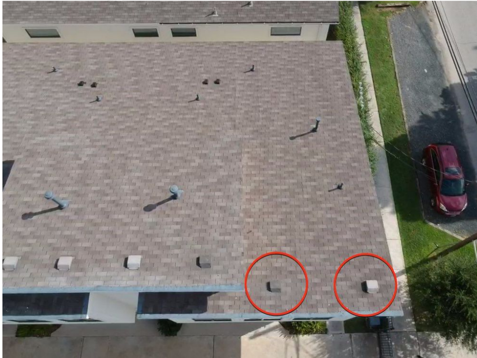
Leaking square vents