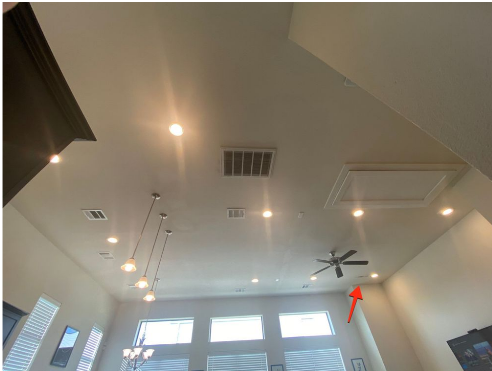
Water marks due to leak on ceiling.