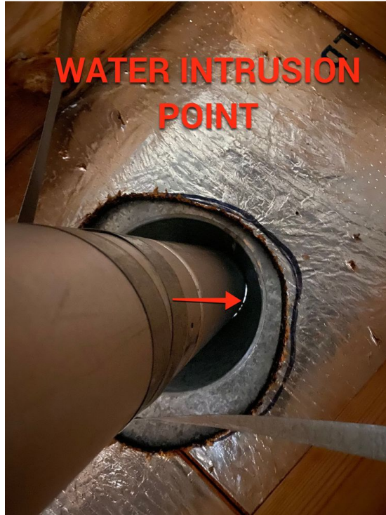
Water intrusion point through an HVAC pipe.