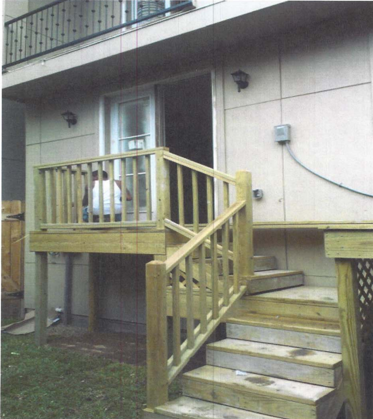
Rear of House