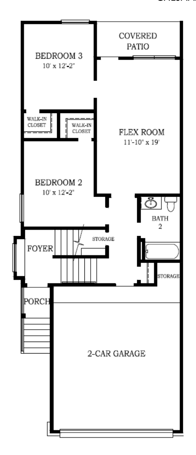
2nd Floor Plan 1st Floor Plan

Square footage and room dimensions are approximate and may vary per elevation. Window placement, roof line and porches may also vary by elevation. Plans, features, prices and availability are subject to change without notice. Print date: 4/29/14