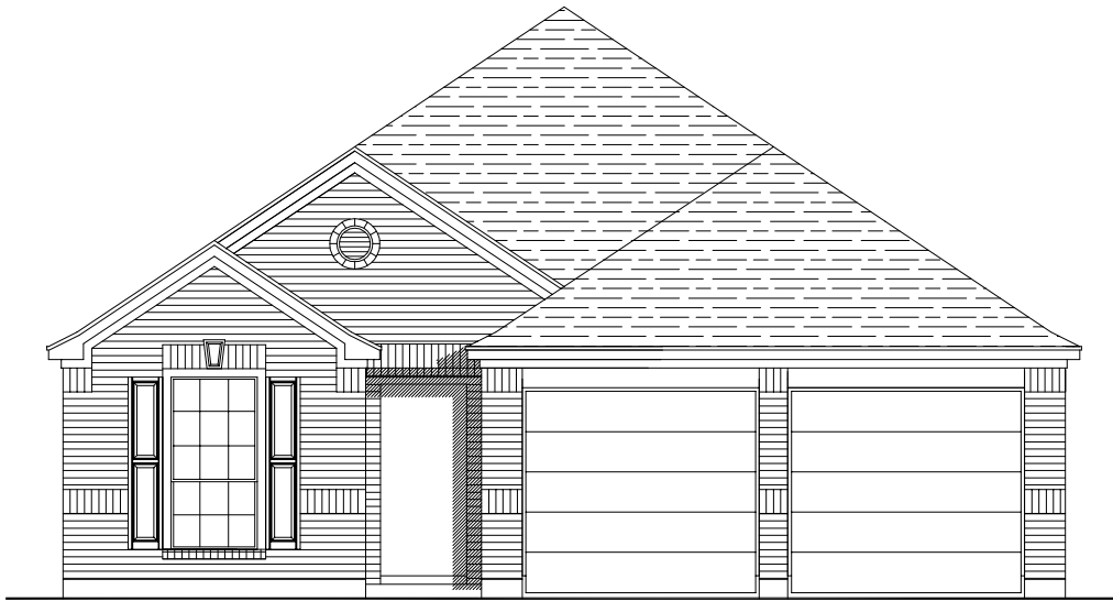
PLAN 1550W E-2