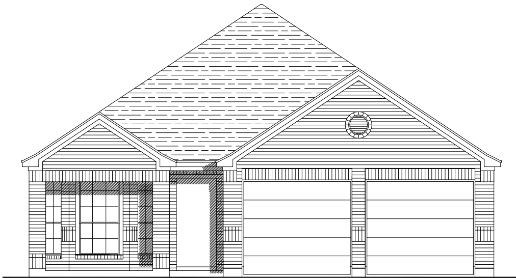
PLAN 1550W E-30