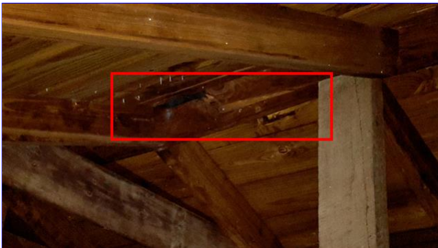
D. Item 1(Picture) broken framing in attic at ridge

There is broken framing at ridge in attic space this can affect the structural integrity of the home. I recommend having a qualified person make repairs as needed.