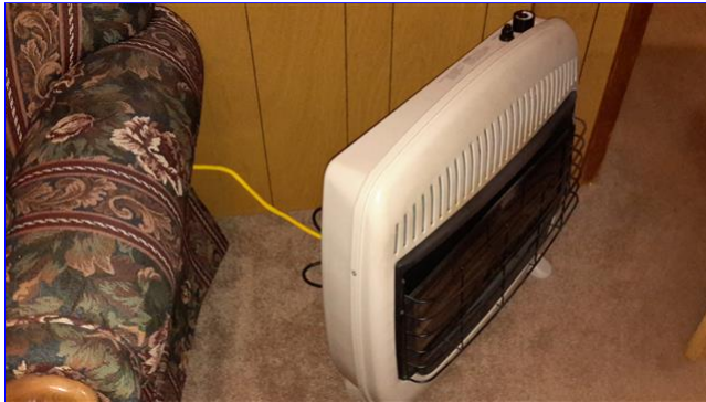
A. Item 1(Picture)

We do not inspect gas space heaters. Gas units sitting directly on carpet are considered to be a fire hazard. I recommend having a qualified person make repairs as needed.