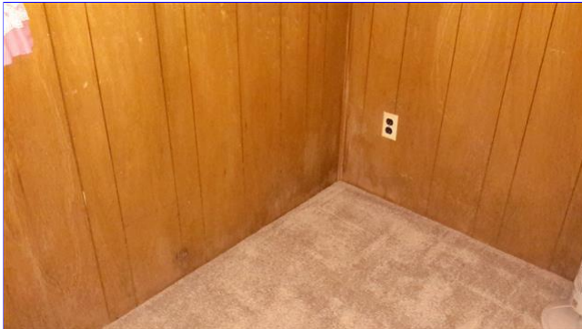
E. Item 2(Picture) Back left bedroom