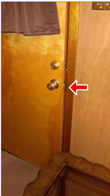
G. Item 1(Picture) Front door

The front and rear entry doors to the home are sticking or rubbing on the door jambs this indicates settlement. I recommend having a qualified person make repairs as needed.