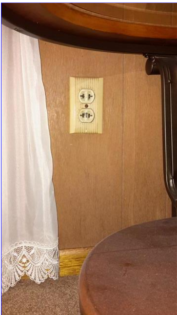
B. Item 2(Picture) left wall of living room

(4) One "two-prong" outlet is not working in the living room. Electrical issues are considered a hazard until repaired. A qualified licensed electrical contractor should perform repairs that involve wiring.