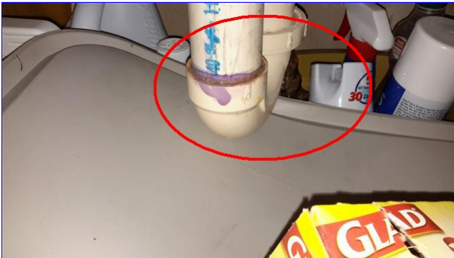
B. Item 2(Picture) left side kitchen sink