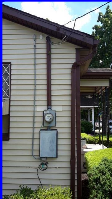
Over head service