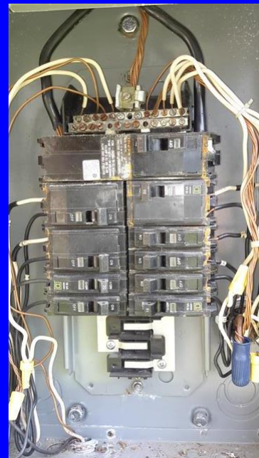
100 amp square d