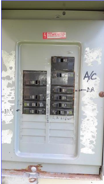
A. Item 1(Picture)

(2) The main power shut off breaker (100 amp) in main panel is corroded inside. Electrical issues are considered a hazard until repaired. I recommend having a qualified electrician make repairs as needed.