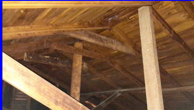
2x4 rafters stick built

The Home Inspector shall observe structural components including foundations, floors, walls, columns or piers, ceilings and roof. The home inspector shall describe the type of Foundation, floor structure, wall structure, columns or piers, ceiling structure, roof structure. The home inspector shall: Probe structural components where deterioration is suspected; Enter under floor crawl spaces, basements, and attic spaces except when access is obstructed, when entry could damage the property, or when dangerous or adverse situations are suspected; Report the methods used to observe under floor crawl spaces and attics; and Report signs of abnormal or harmful water penetration into the building or signs of abnormal or harmful condensation on building components. The home inspector is not required to: Enter any area or perform any procedure that may damage the property or its components or be dangerous to or adversely effect the health of the home inspector or other persons.