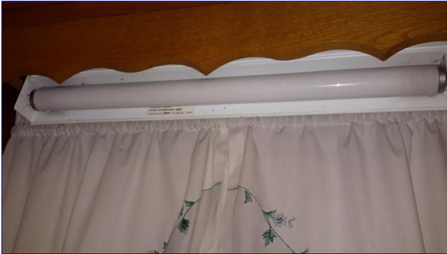
B. Item 1(Picture) Above kitchen sink

(4) One "two-prong" outlet is not working in the living room. Electrical issues are considered a hazard until repaired. A qualified licensed electrical contractor should perform repairs that involve wiring.