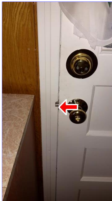
G. Item 2(Picture) Back door