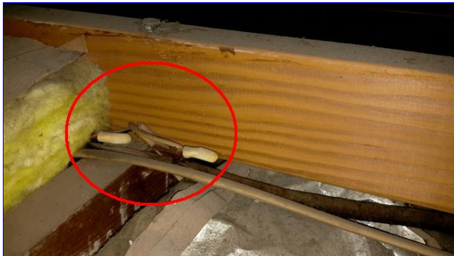
B. Item 3(Picture)