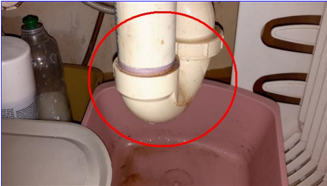
B. Item 1(Picture) Right side under kitchen sink

The p-trap on waste line is leaking at the Kitchen sink. Repairs are needed. A qualified licensed plumber should repair or correct as needed.