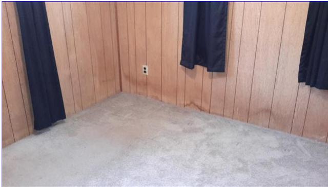
E. Item 1(Picture) Back right bedroom

The wood panels on the wall shows wet stains indicating moisture or intrusion did or still may occur at the back two bedrooms and the front living room wall.. While this damage is cosmetic, it needs to be repaired. A qualified person should repair or replace as needed.