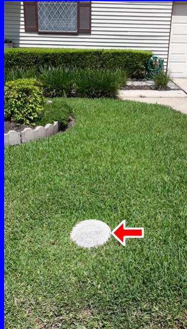
Water meter front of home