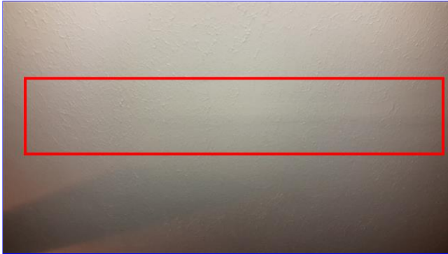
F. Item 1(Picture) Back left bedroom