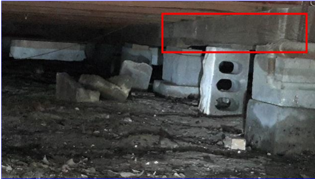
A. Item 1(Picture) Under center of home

(2) There is a damaged beam under the center of the home that has been repaired but the repair is starting to fail and is in need of additional repair. I recommend having a qualified person make repairs as needed.