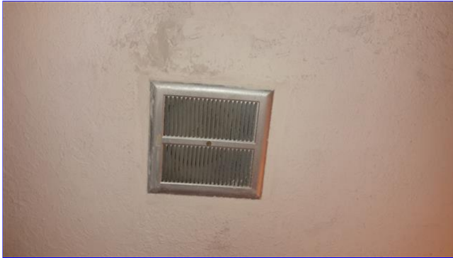
F. Item 1(Picture)