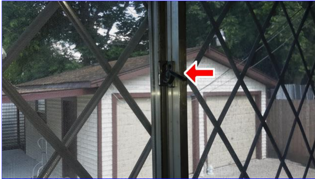
H. Item 1(Picture)