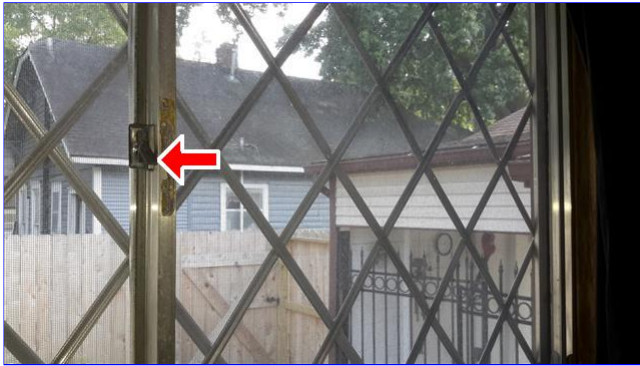
H. Item 2(Picture)