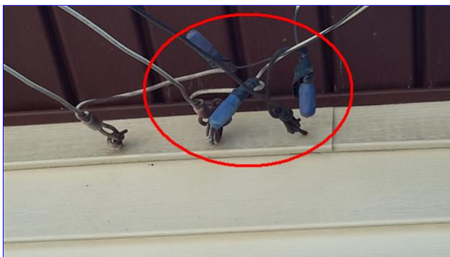
B. Item 4(Picture) Back right corner of home

The electrical system of the home was inspected and reported on with the above information. While the inspector makes every effort to find all areas of concern, some areas can go unnoticed. Outlets were not removed and the inspection was only visual. Any outlet not accessible (behind the refrigerator for example) was not inspected or accessible. Please be aware that the inspector has your best interest in mind. Any repair items mentioned in this report should be considered before purchase. It is recommended that qualified contractors be used in your further inspection or repair issues as it relates to the comments in this inspection report.