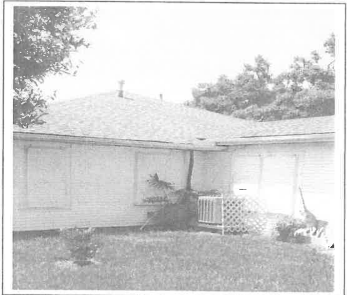
REAR VIEW 5-19-2015