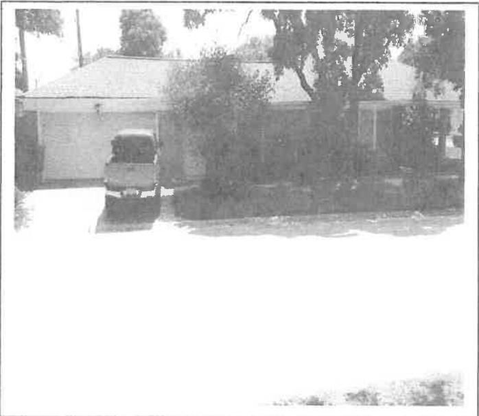
LEFT SIDE VIEW 5-19-2015