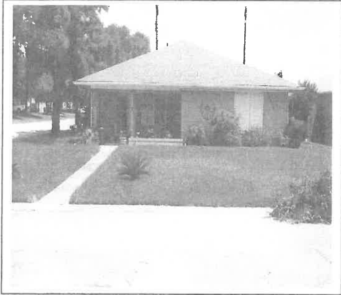
FRONT VIEW 5-19-2015

If using the Elevation Certificate to obtain NFIP flood insurance, affix at least 2 building photographs below according to the instructions for Item A6. Identify all photographs with date taken; "Front View" and "Rear View"; and, if required, "Right Side View" and "Left Side View." When applicable, photographs must show the foundation with representative examples of the flood openings or vents, as indicated in Section A8. If submitting more photographs than will fit on this page, use the Continuation Page.