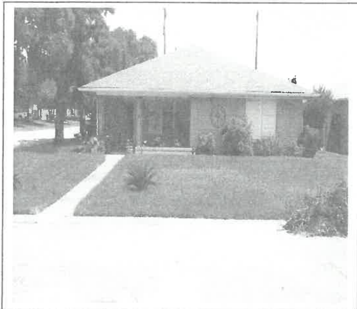
FRONT VIEW 5-19-2015

If using the Elevation Certificate to obtain NFIP flood insurance, affix at least 2 building photographs below according to the instructions for Item A6. Identify all photographs with date taken; "Front View" and "Rear View"; and, if required, "Right Side View" and "Left Side View." When applicable, photographs must show the foundation with representative examples of the flood openings or vents, as indicated in Section A8. If submitting more photographs than will fit on this page, use the Continuation Page.