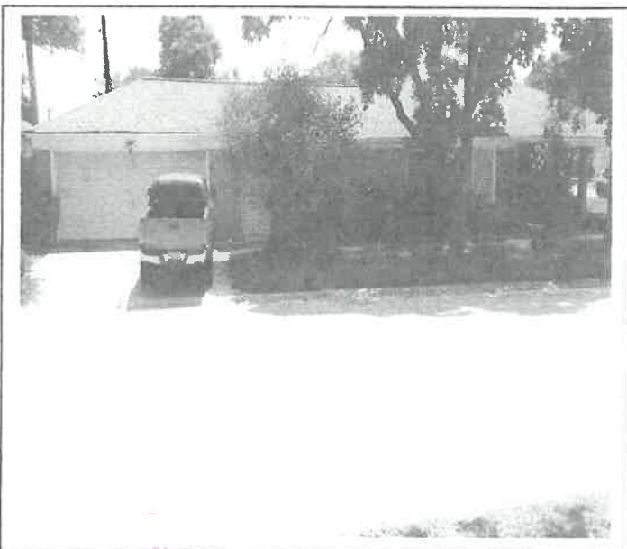
LEFT SIDE VIEW 5-19-2015