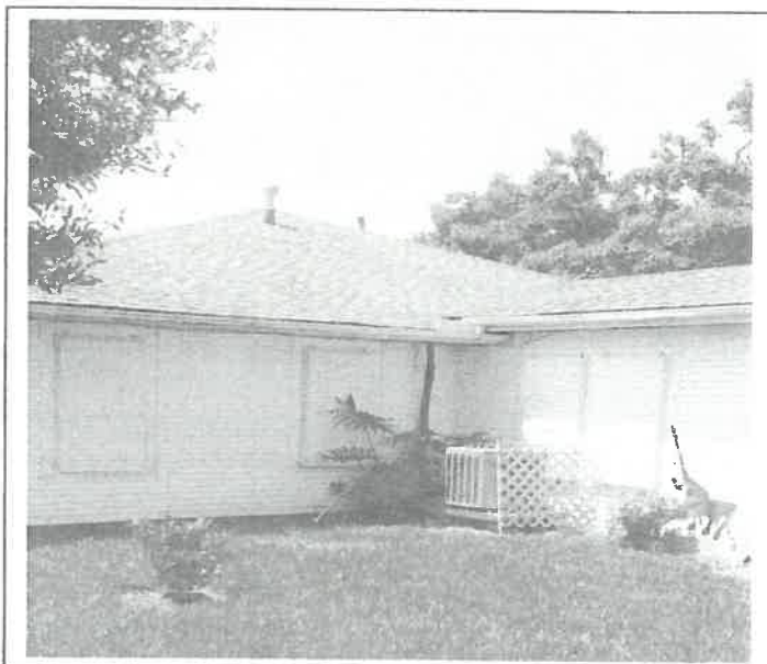
REAR VIEW 5-19-2015