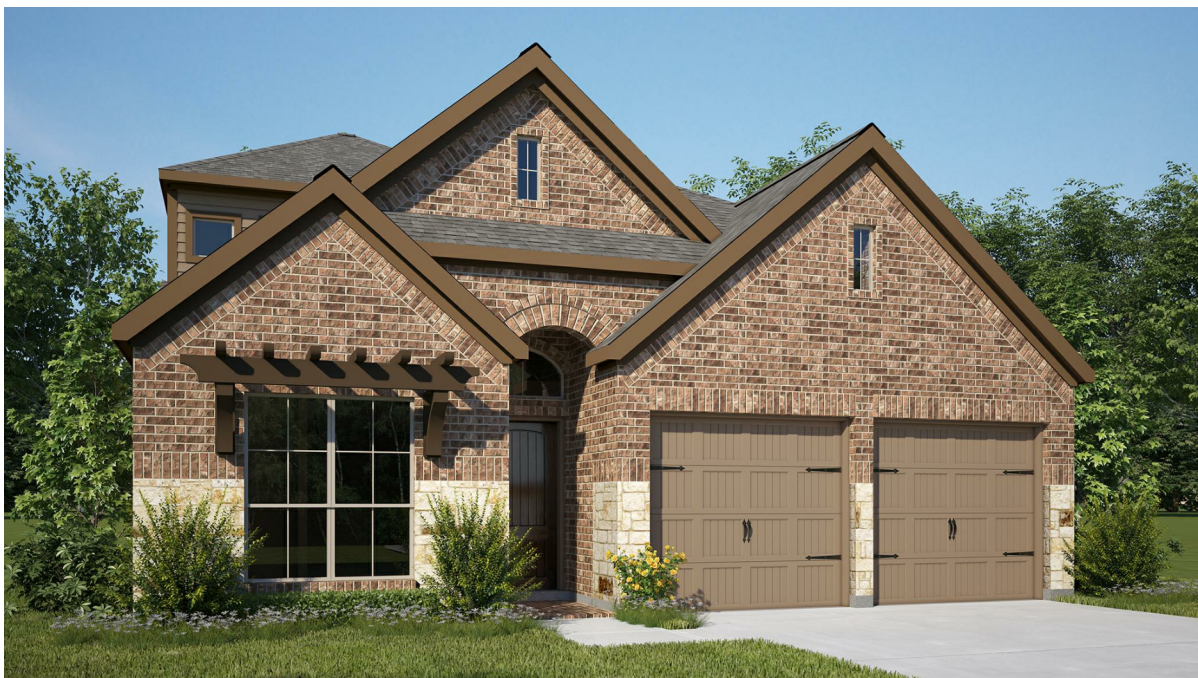
DESIGN 2100W E-30