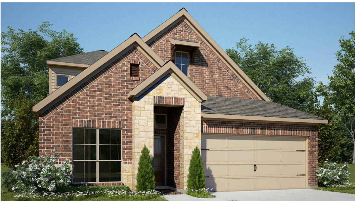
DESIGN 2100W E-50

This design, as originally designed and prior to any changes you make, is estimated to yield approximately the number of square feet shown on page 1. All dimensions are approximate. Square footage may vary based on as-built dimensions, configurations, plan options and/or the method of calculation. Designs are not-to-scale, and are conceptual illustrations that may differ from construction plans or completed improvements. A design may depict features not available on all homesites or in all communities. Perry Homes reserves the right to make changes in plans and specifications, and to substitute material of similar quality. Prices, terms, promotions, plans, dimensions, features, options, amenities, elevations, designs, square footages, specifications, materials, and availability of homes or communities are subject to change without notice or obligation. All obligations will be governed by a written contract. This design does not constitute a commitment to build a particular floor plan or home in any given community. Some floor plans, options, and/or elevations may not be available on certain homesites or in a particular community and may require additional charges. Please check with Perry Homes to verify current offerings in the communities you are considering. This rendering is the property of Perry Homes, LLC. Any reproduction or exhibition is strictly prohibited. © Perry Homes, LLC 2020