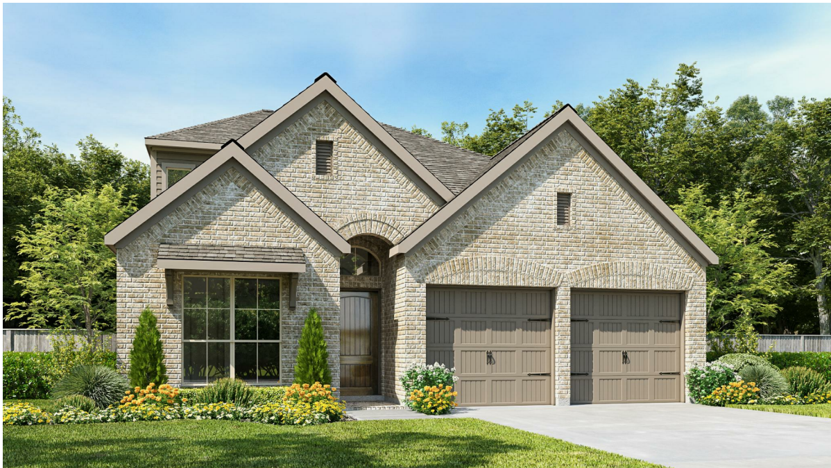
DESIGN 2100W E-1