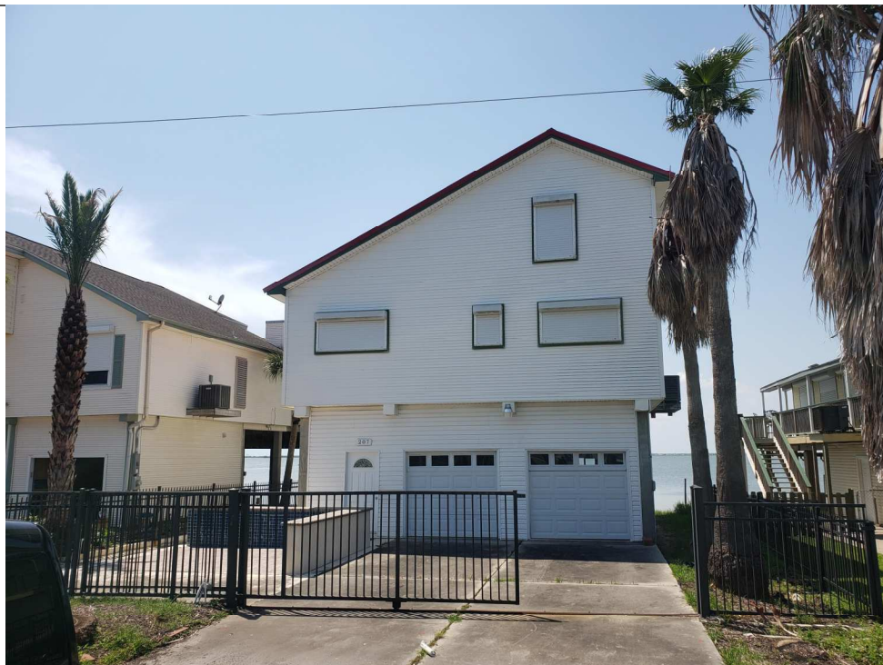
Photo One Caption FRONT VIEW

If using the Elevation Certificate to obtain NFIP flood insurance, affix at least 2 building photographs below according to the instructions for Item A6. Identify all photographs with date taken; "Front View" and "Rear View"; and, if required, "Right Side View" and "Left Side View." When applicable, photographs must show the foundation with representative examples of the flood openings or vents, as indicated in Section A8. If submitting more photographs than will fit on this page, use the Continuation Page.