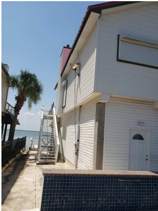
Photo Four Caption LEFT SIDE VIEW