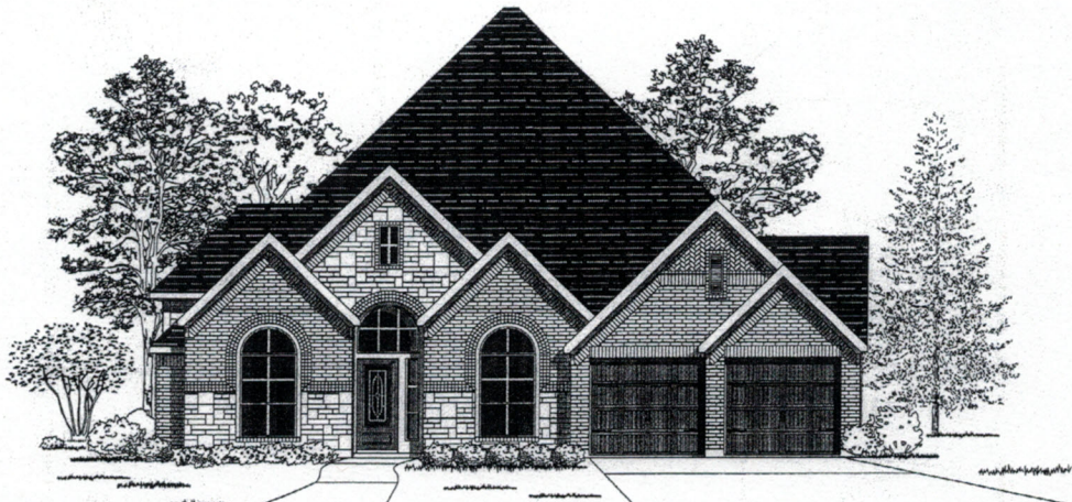
Design 3481W E-30