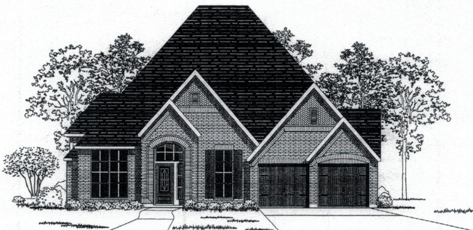
Design 3481W E-31

This design, as originally designed and prior to any changes you make, is estimated to yield approximately the number of square feet shown on page 1. All dimensions are approximate. Square footage may vary based on as-built dimensions, configurations, plan options and/or the method of calculation. Designs are not-to-scale, and are conceptual illustrations that may differ from construction plans or completed improvements. A design may depict features not available on all homesites or in all communities. Perry Homes reserves the right to make changes in plans and specifications, and to substitute material of similar quality. Prices, terms, promotions, plans, dimensions, features, options, amenities, elevations, designs, square footages, specifications, materials, and availability of homes or communities are subject to change without notice or obligation. All obligations will be governed by a written contract. This design does not constitute a commitment to build a particular floor plan or home in any given community. Some floor plans, options, and/or elevations may not be available on certain homesites or in a particular community and may require additional charges. Please check with Perry Homes to verify current offerings in the communities you are considering. This rendering is the property of Perry Homes, LLC. Any reproduction or exhibition is strictly prohibited.