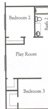
Optional Play Room