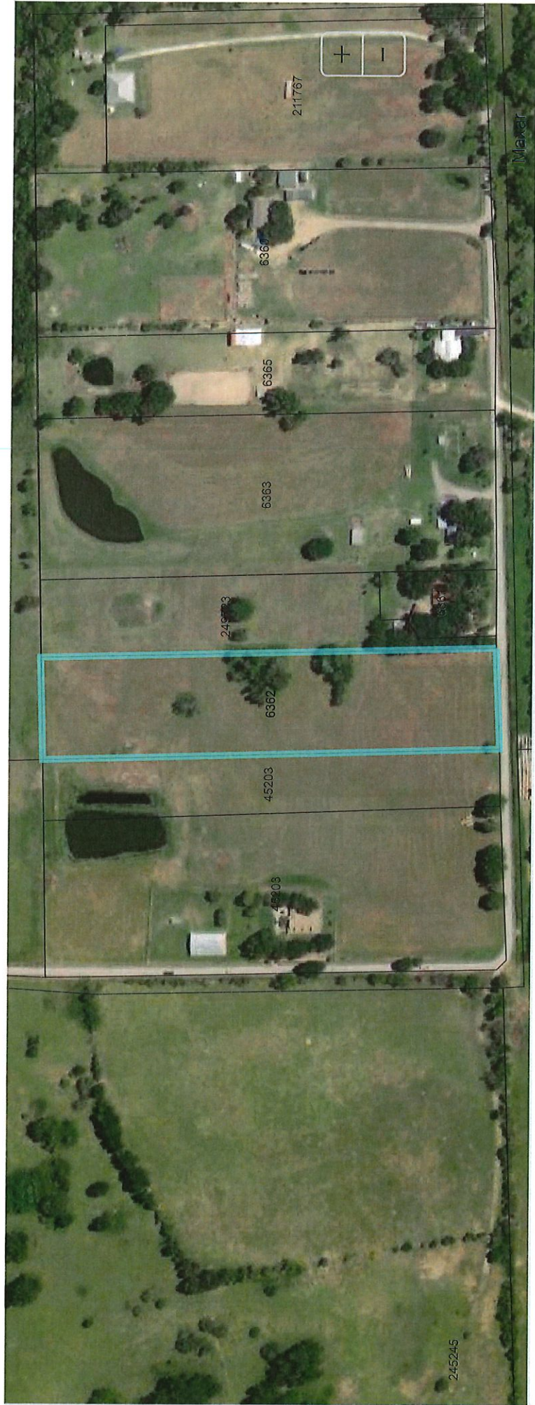
Waller CAD Map Search