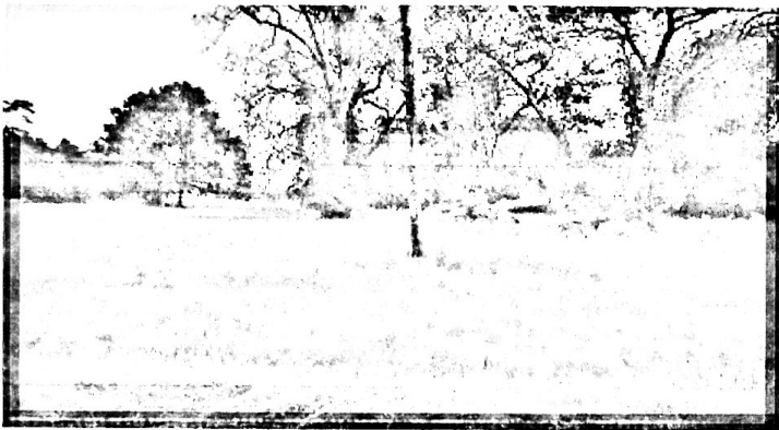
FRONT VIEW (VACANT & TBM LOCATION)

If using the Elevation Certificate to obtain NFIP flood insurance, affix at least 2 building photographs below according to the instructions for Item A6. Identify all photographs with date taken; "Front View" and "Rear View"; and, if required, "Right Side View" and "Left Side View." When applicable, photographs must show the foundation with representative examples of the flood openings or vents, as indicated in Section A8. If submitting more photographs than will fit on this page, use the Continuation Page.