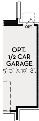
OPT. 1/2 CAR GARAGE 106 SQ. FT.