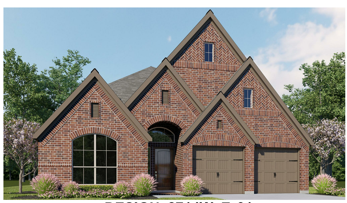
DESIGN 2714W E-31