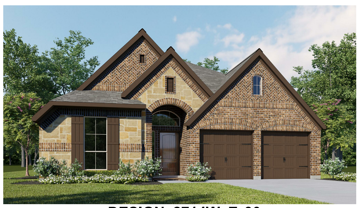
DESIGN 2714W E-30