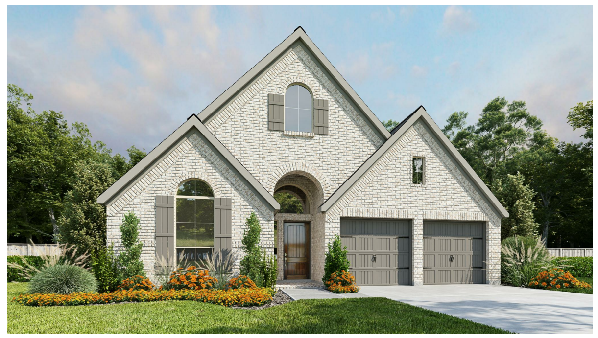
DESIGN 2714W E-1