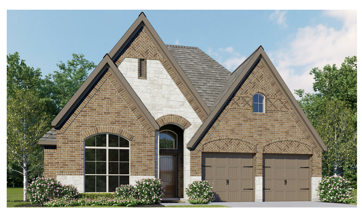
DESIGN 2714W E-50

This design, as originally designed and prior to any changes you make, is estimated to yield approximately the number of square feet shown on page 1. All dimensions are approximate. Square footage may vary based on as-built dimensions, configurations, plan options and/or the method of calculation. Designs are not-to-scale, and are conceptual illustrations that may differ from construction plans or completed improvements. A design may depict features not available on all homesites or in all communities. Perry Homes reserves the right to make changes in plans and specifications, and to substitute material or similar quality. Prices, terms, promotions, plans, dimensions, features, options, amenities, elevations, designs, square footages, specifications, materials, and availability of homes or communities are subject to change without notice or obligation. All obligations will be governed by a written contract. This design does not constitute a commitment to build a particular floor plan or home in any given community some floor plans, options, and/or elevations may not be available on certain homesites or in a particular community and may require additional charges. Please check with Perry Homes to verify current offerings in the communities you are considering. This rendering is the property of Perry Homes, LLC. Any reproduction or exhibition is strictly prohibited. © Perry Homes, LLC. 2020