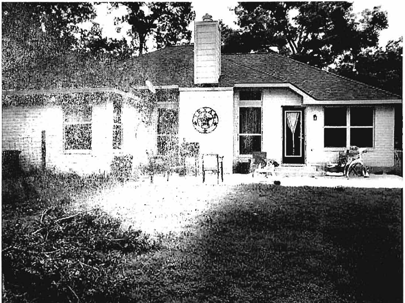
Rear of house

If submitting more photographs than will fit on the preceding page, affix the additional photographs below. Identify all photographs with: date taken; "Front View" and "Rear View"; and, if required, "Right Side View" and "Left Side View." When applicable, photographs must show the foundation with representative examples of the flood openings or vents, as indicated in Section A8.