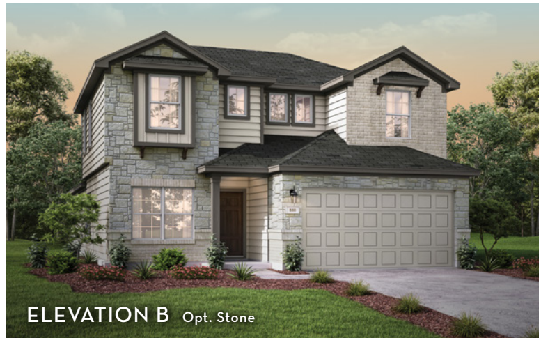
ELEVATION B Opt. Stone