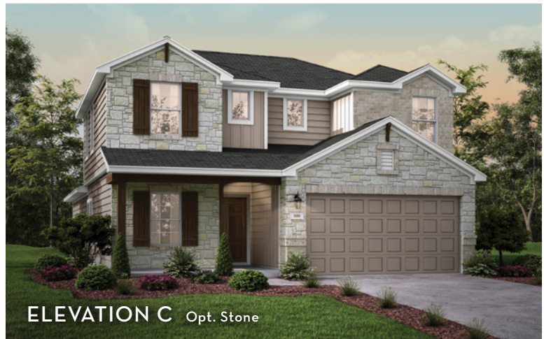
ELEVATION C Opt. Stone