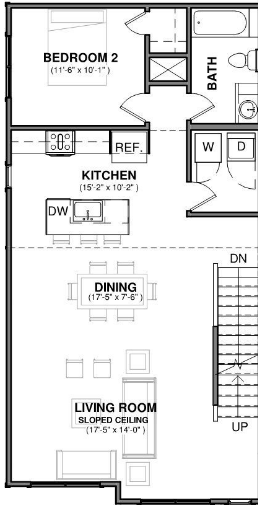
2/ Second Floor 1/8" = 1'-0"