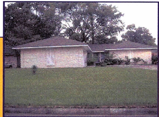
2311 WHISPERING WINDS LANE HUMBLE, TEXAS 77339

Lot Eighty-eight (88), in Block Three (3), of SHERWOOD TRAILS SECTION ONE (1), a subdivision in Harris County, Texas, according to map or plat thereof recorded in Volume 230, Page 89, of the Map Records of Harris County, Texas.