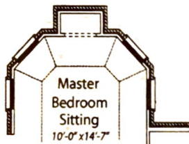
Master Bedroom Sitting Option