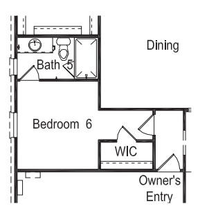
Opt Bed 6 / Bath 5 ilo Tandem - Not Available w/ Bed 5 / Bath 4 / Half Bath ilo Flex / Half Bath