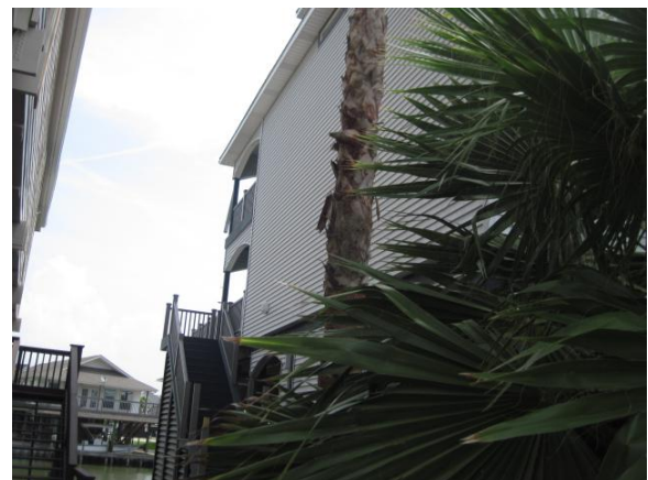
LEFT SIDE VIEW 06-29-2015