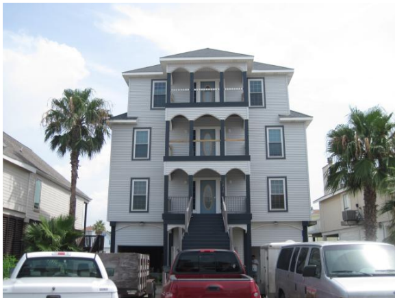
RIGHT SIDE VIEW 06-29-2015