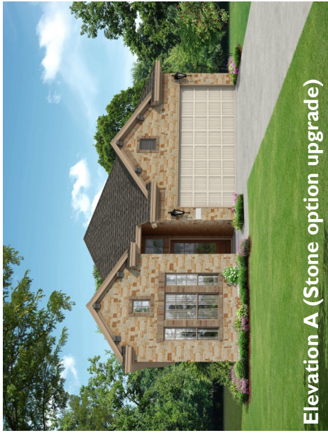
Elevation A (Stone option upgrade)