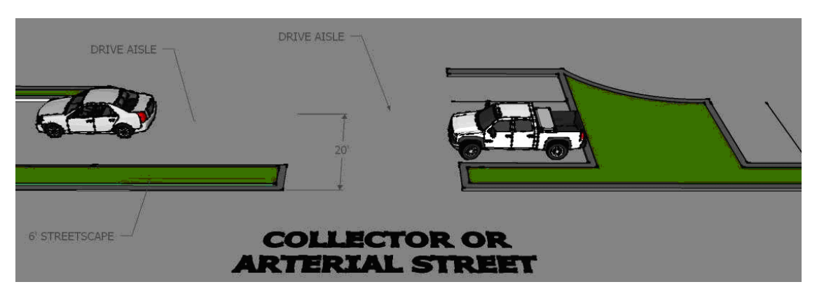
Examples of Configurations that are Not Allowed