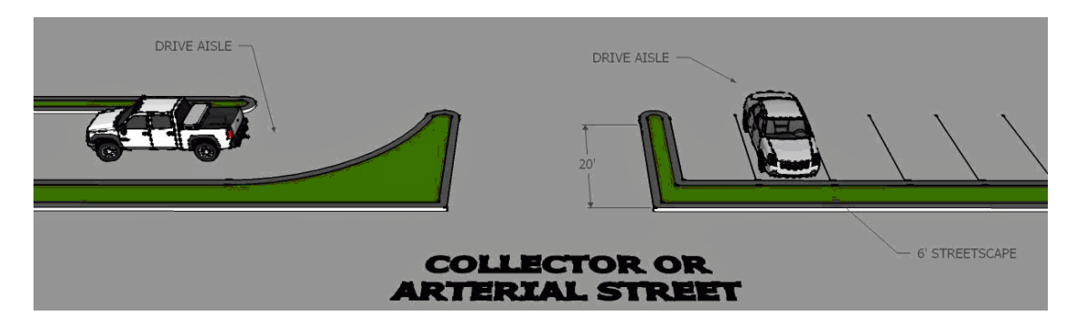
Examples of Allowable Configurations