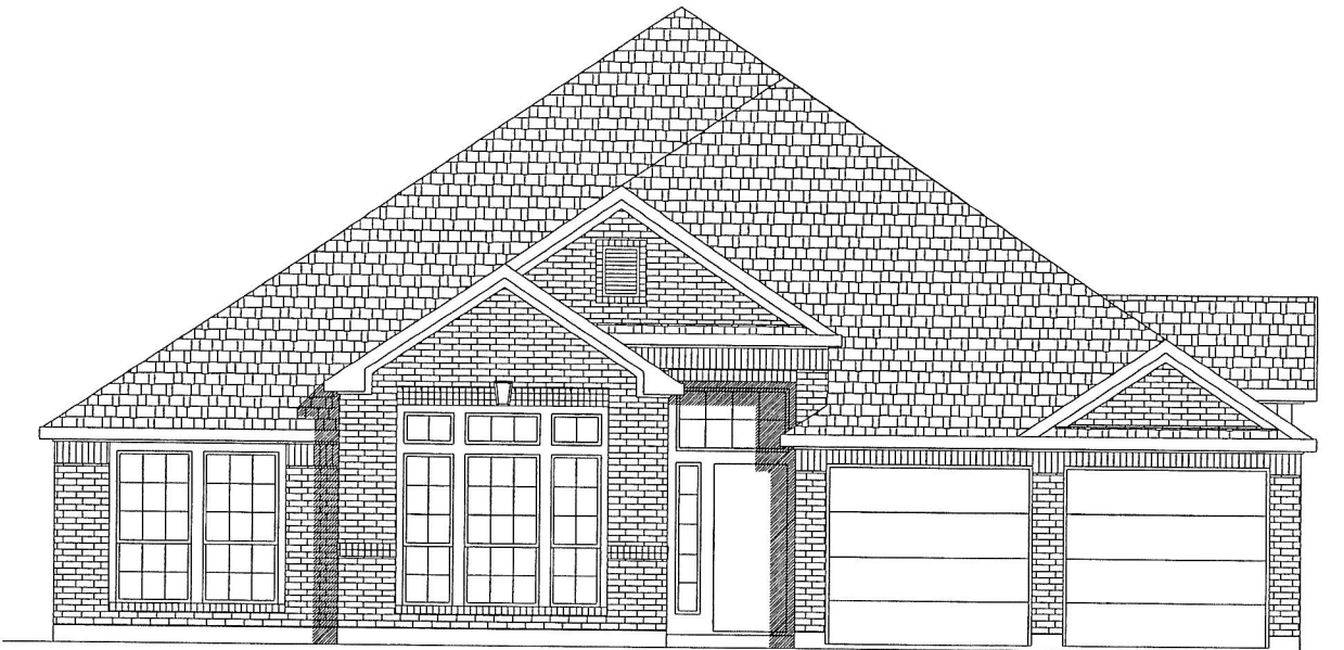
PLAN 2942W E-2