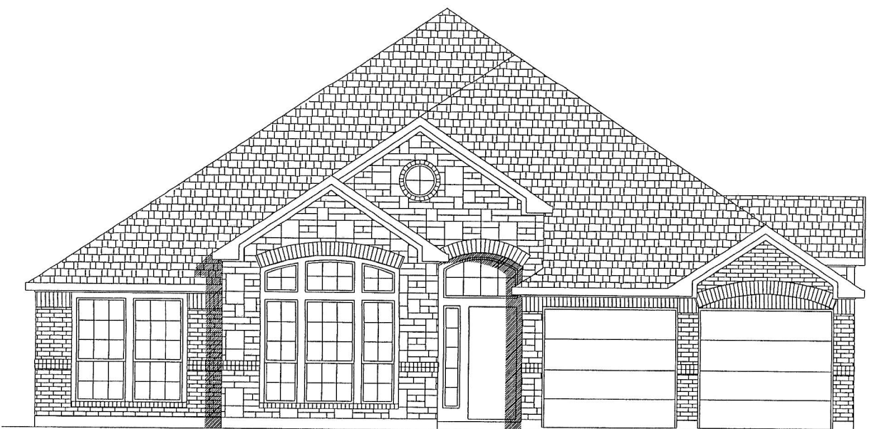
PLAN 2942W E-50 OPTIONAL ELEVATION