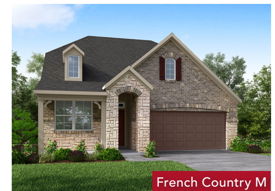
French Country M