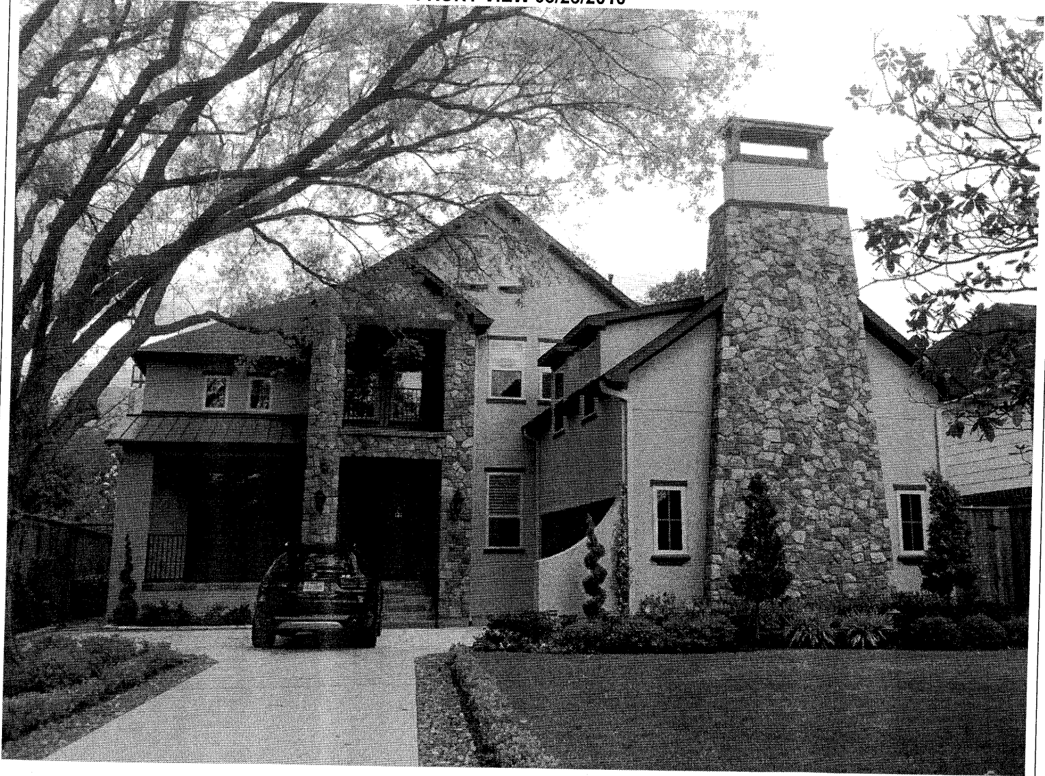
FRONT VIEW 03/25/2016

If using the Elevation Certificate to obtain NFIP flood insurance, affix at least 2 building photographs below according to the instructions for Item A6. Identify all photographs with date taken; "Front View" and "Rear View"; and, if required, "Right Side View" and "Left Side View." When applicable, photographs must show the foundation with representative examples of the flood openings or vents, as indicated in Section A8. If submitting more photographs than will fit on this page, use the Continuation Page.