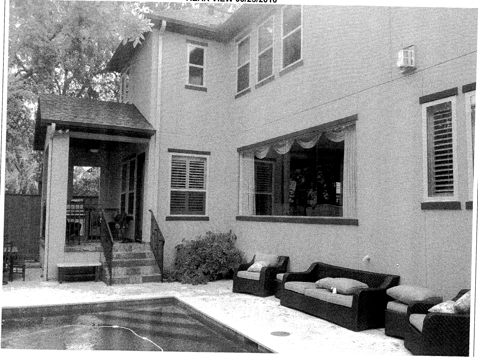
REAR VIEW 03/25/2016

If submitting more photographs than will fit on the preceding page, affix the additional photographs below. Identify all photographs with: date taken; "Front View" and "Rear View"; and, if required, "Right Side View" and "Left Side View." When applicable, photographs must show the foundation with representative examples of the flood openings or vents, as indicated in Section A8.