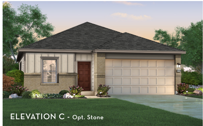
ELEVATION C - Opt. Stone