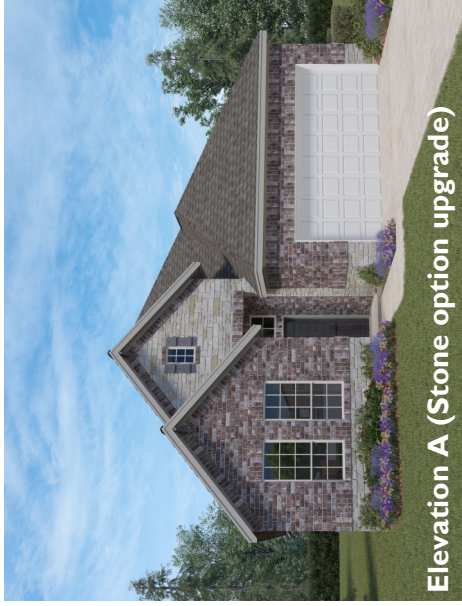
Elevation A (Stone option upgrade)