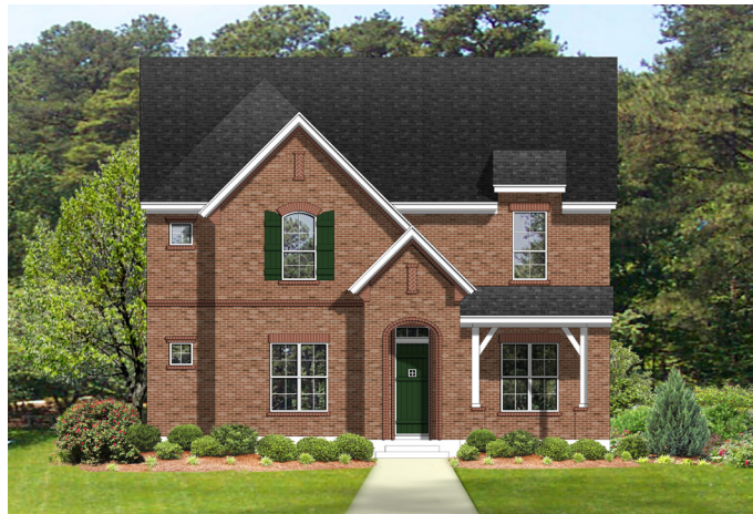
"B" FRONT ELEVATION - TUDOR