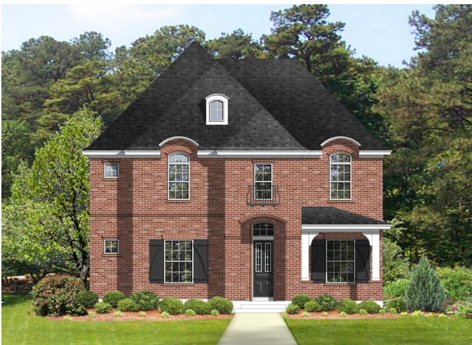
"C" FRONT ELEVATION - FRENCH