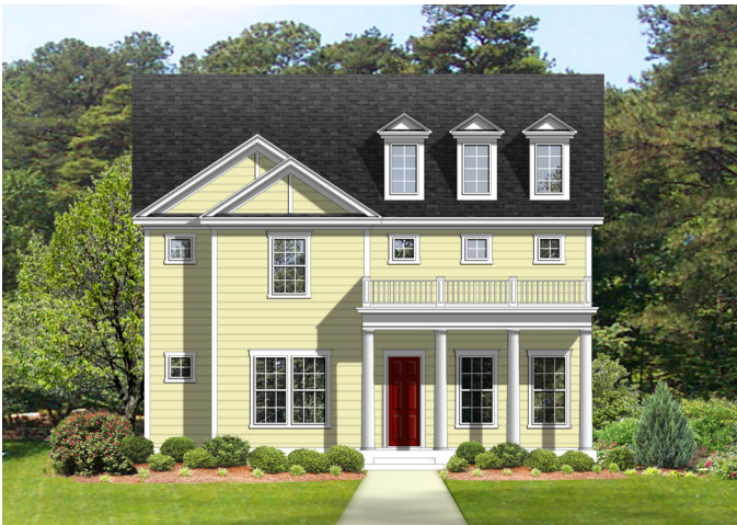
"A" FRONT ELEVATION - CLASSIC