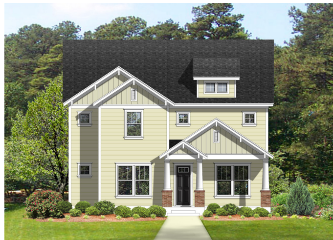
"D" FRONT ELEVATION - CRAFTSMAN