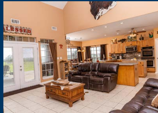
Great Room Floor Plan