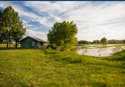
Cabin with Full Kitchen & Bath