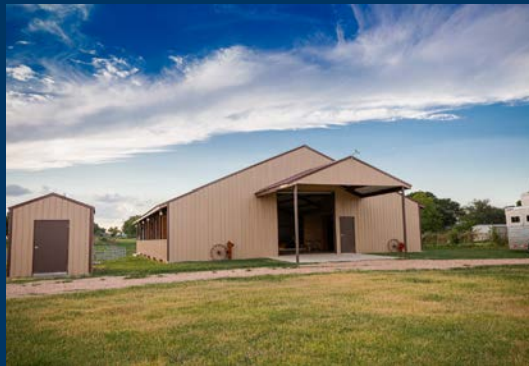
5-Stall Horse Barn with Half Bath